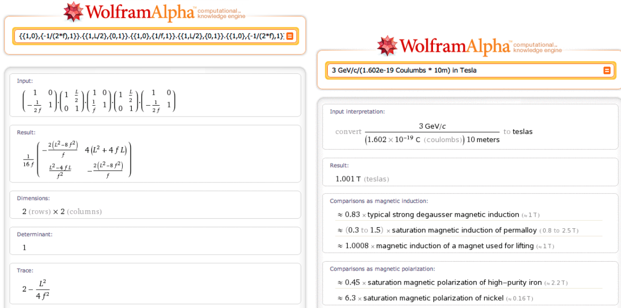
Figure 2: A simple FODO cell calculation, and a calculation of required magnetic field to bend a q = e , p = 3 \text{ GeV}/c particle through a bending radius of \rho = 10 \text{ m} in Wolfram Alpha.

Both Google and Alpha also serve as excellent symbolic calculators and unit converters. For example, type